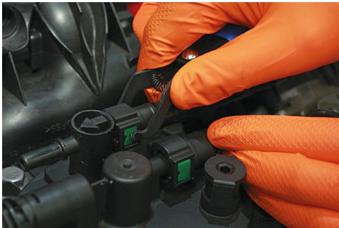
Scarab Quick Connector Disconnect Tool | 7826